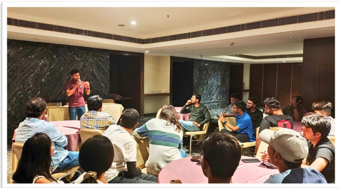
The members exhibited their skills and talents before the audience.