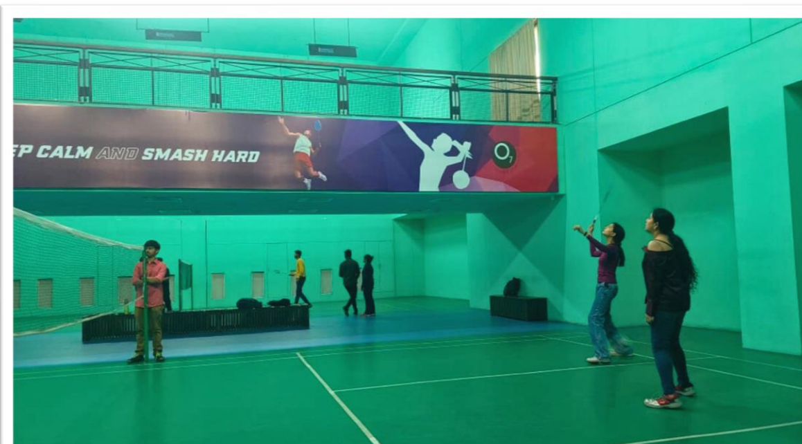
The attendees also relished a delightful time engaging in the sport of badminton.