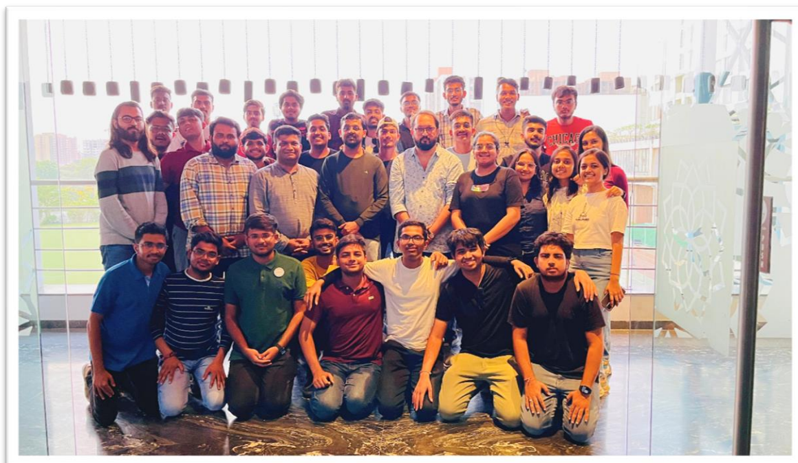
A photograph comprising of all the attending members and faculties together as a group.