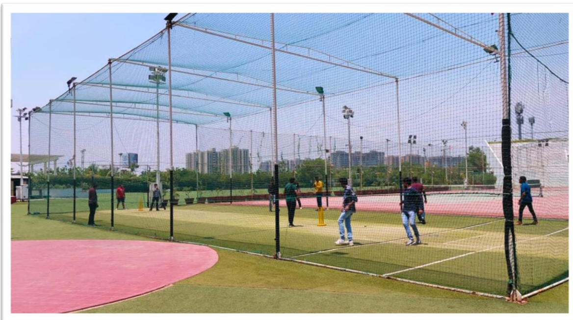
All members participated in an exciting game of box cricket.