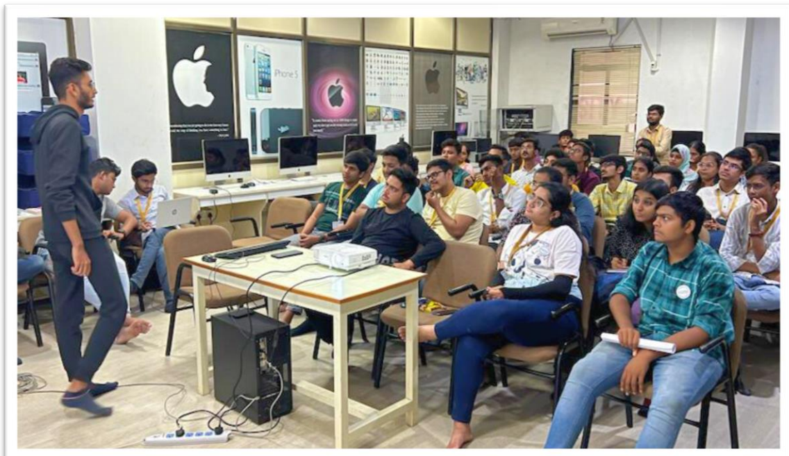
Getting started with hacking basics