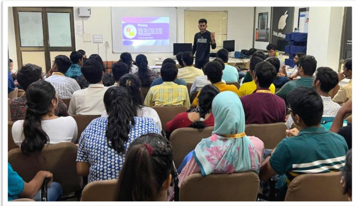
Introducing participants to Cyber Security