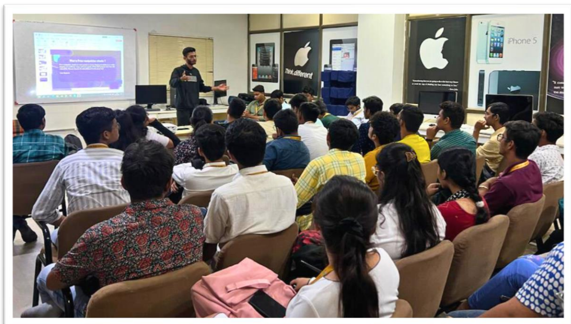
Extracting information for price manipulation