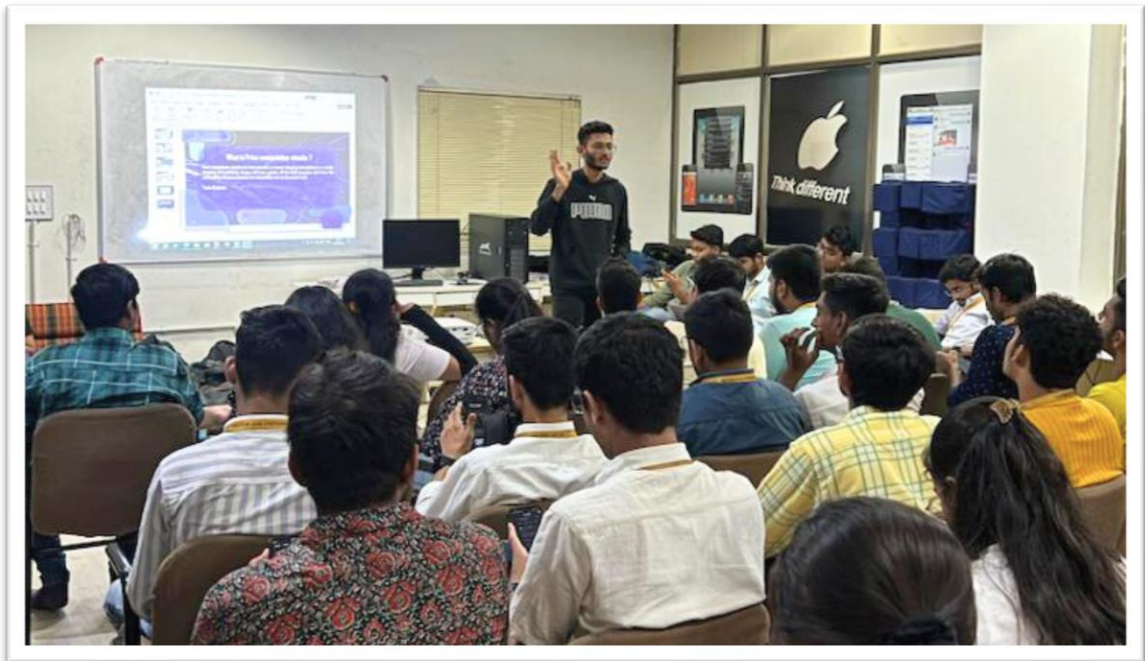
Hands-on workshop for phishing