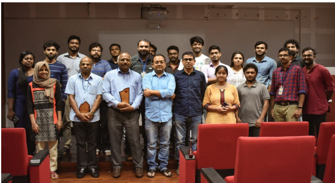
Photo session at the end of IEEE EMBS student chapter inauguration program