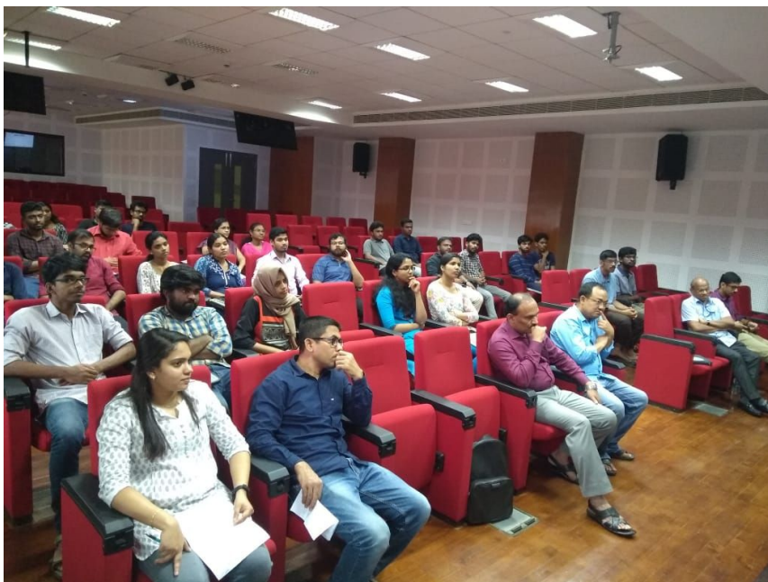
Attention of audience in IEEE student chapter inauguration program