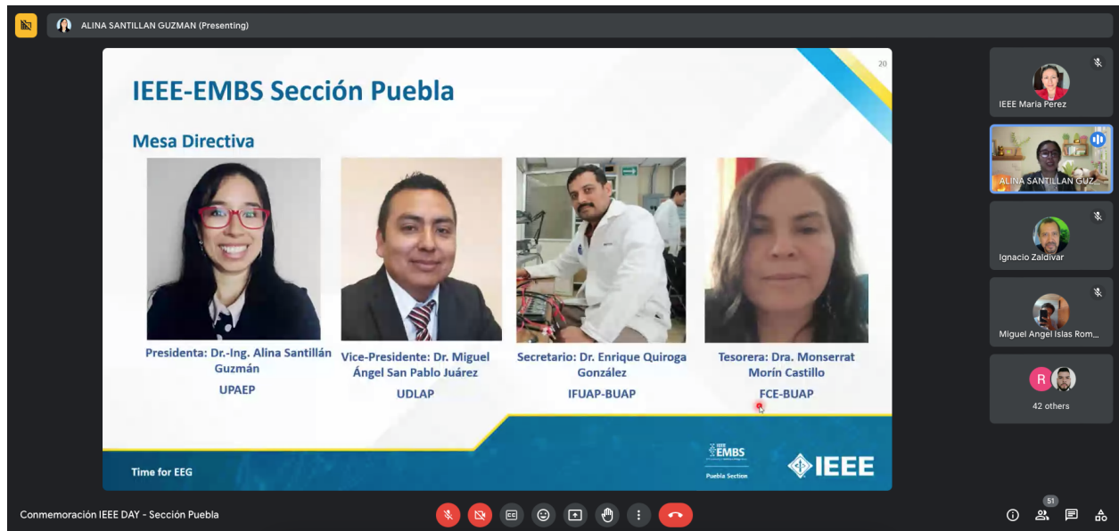
Image 2. IEEE - EMBS Puebla Section