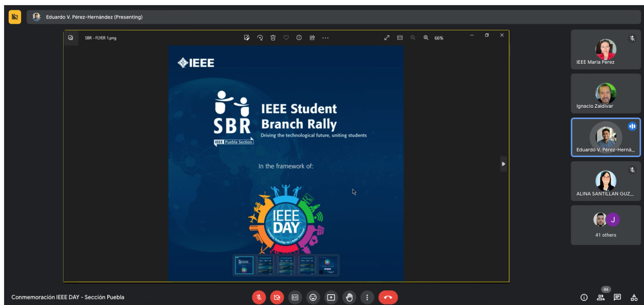
Image 3. Student Branch Rally presentation