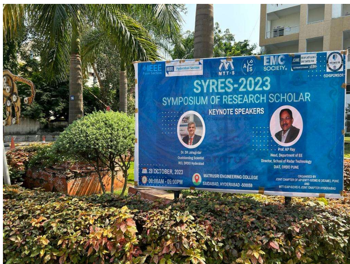
SYRES Poster at Matrusri Engineering College, Hyderabad