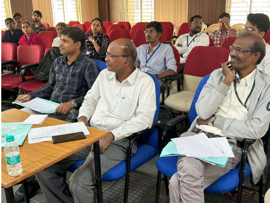
Judges for PG Category