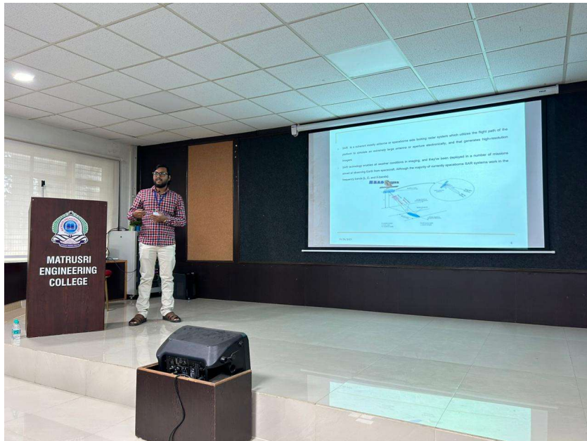
PhD Session in Progress