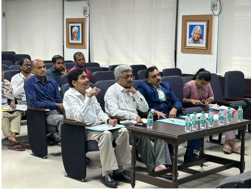
Judges for PhD Category