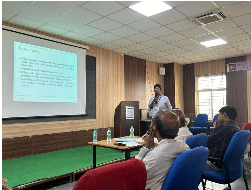
PG Session in Progress