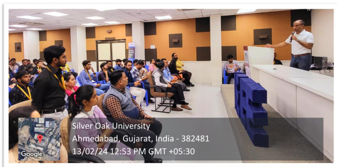
The speaker addressing the participants' doubts