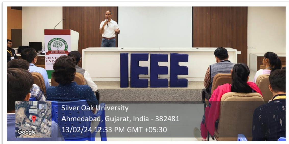
The expert delving participants into the IT world