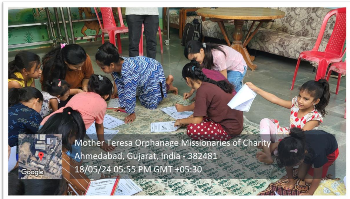
Explaining safe touch through illustrations