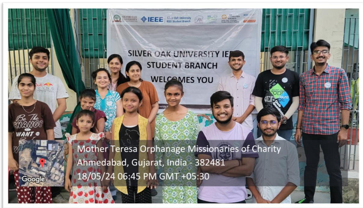
Group photo with all the girls