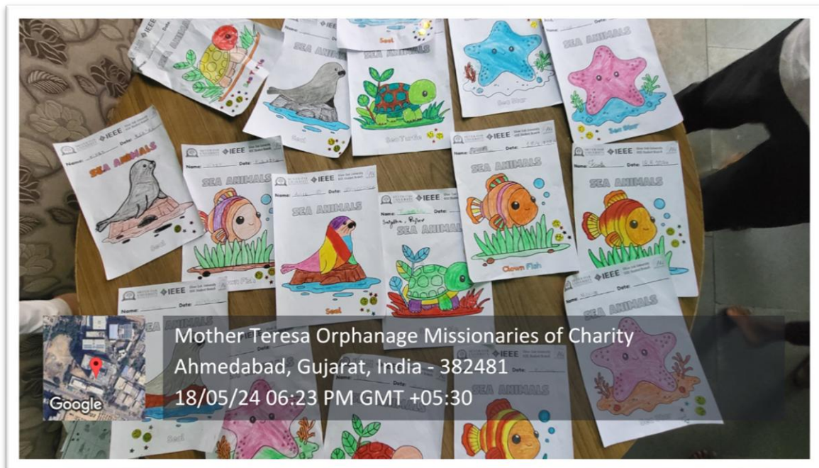
Colouring activity on sea animals