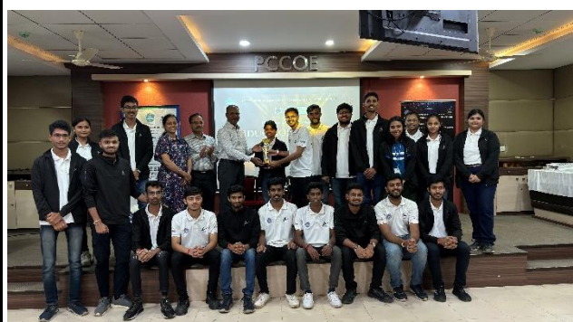
Felicitations of Team Automaton