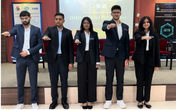
Oath taking ceremony