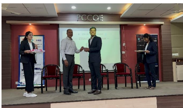
Honoring Advisors followed by newly appointed office bearers