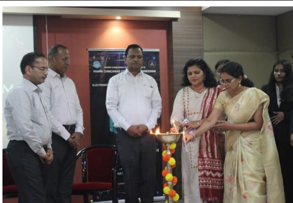
Lighting of the lamp