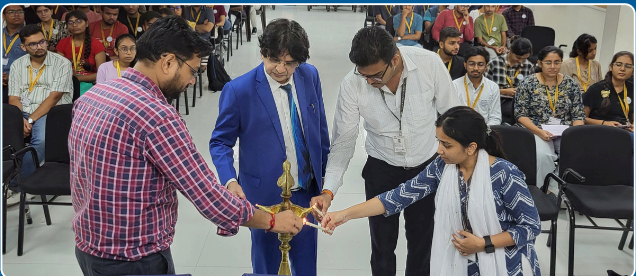
Dignitaries and experts gracefully inaugurating the event with the Deep Pragatya ceremony

The speaker then guided attendees to a journey of inspiration, emphasizing the importance of giving back to the society, which encouraged participants to develop a renewed vision for applying their technical knowledge and education. The session continued to provide day-to-day implementation of