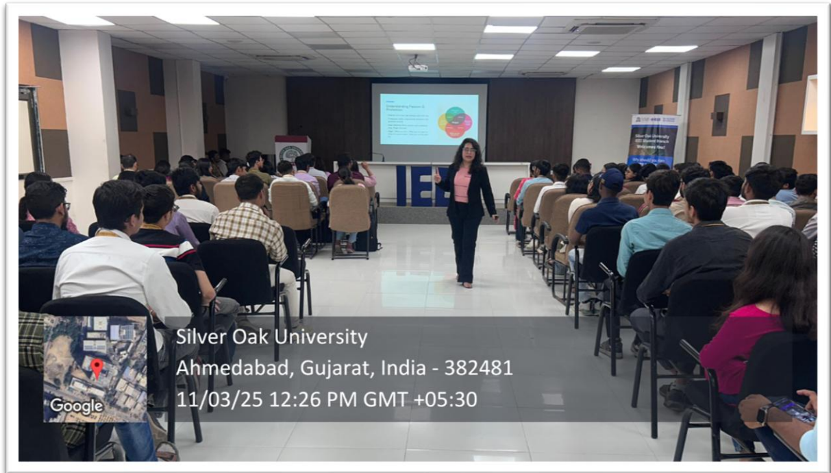
The expert explaining the Ikigai philosophy and finding one's true passion