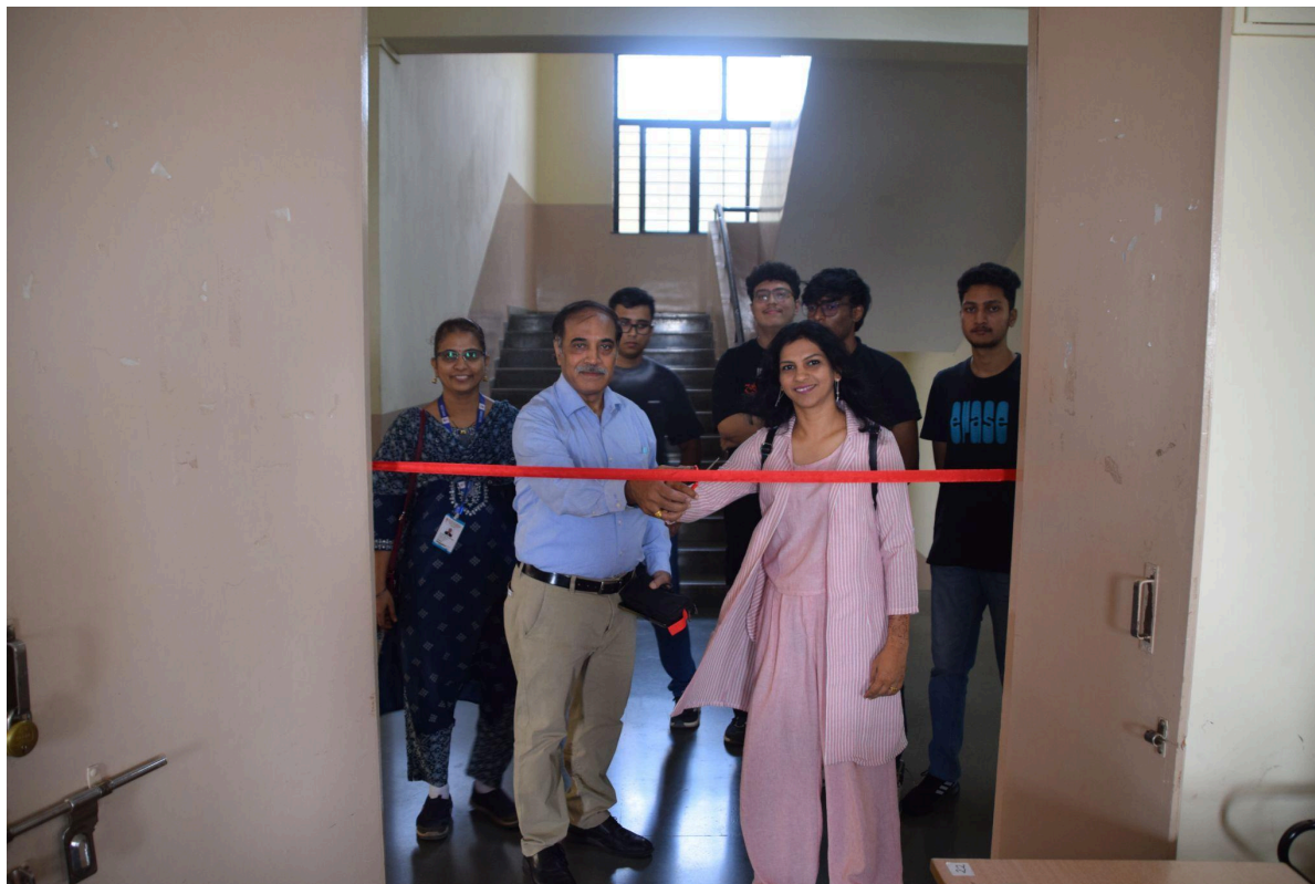
Inauguration ceremony of the Innoverse Hackathon.